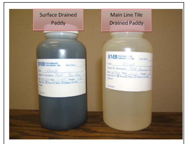
Wild rice paddy surface drainage and main line tile water

The Red Lake Watershed Farm to Stream Tile Drainage Study found that there is an immense difference in the water quality of discharge leaving a surface drained paddy (high sediment concentrations) and a tiledrained paddy (low sediment concentrations). Some of these tiling systems were installed using 319 Loan funding for Phase II of the Clearwater River Nonpoint project. During the TMDL study, we learned of other efforts farmers have made to protect the river. They have left buffers in place along the river. Some have modified stretches of ditches so that they function as sediment traps. Phase II of the Nonpoint Study implemented erosion control projects, buffer strips, and tile drainage in wild rice paddies. The